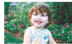
A Child's Joy 2008 Calendar

2009 calenders are being put together now! If you would like your child to be a part of the calender, please email alcgoodhope@aol.com with photos of your child, their first name, & birthdate before October 1st. Reserve your copies early!. A donation of $17.00 will be accepted for each calender. 100% of the profits from your donations will go to Overseas Orphanages to improve the quality of life for the children while they await adoption.